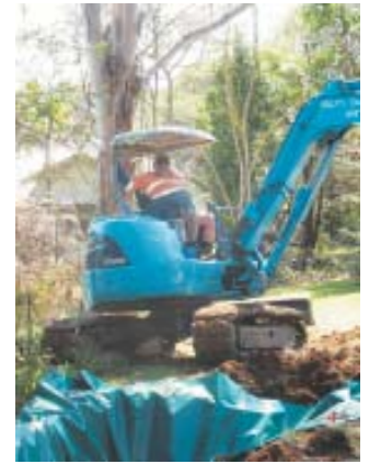
Rolly on the job.

With water a consideration in an era of changing weather conditions, we had two sets of water diviners assess our prospects for a bore, then, after obtaining the appropriate licence, called in the boys from Griggs 'Our Business is Boring' , to drill the bore within our cattle yards. A successful job, they discovered water at precisely the predicted spot.